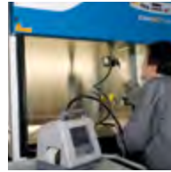
FILTER LEAKAGE TEST