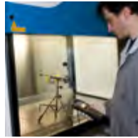
AIR FLOW SPEED TEST

Vertical and horizontal laminar flow cabinets are tested in accordance to ISO 14644-1 and EN-61010:2001 Standards and released with FAT certificate of the tests performed.